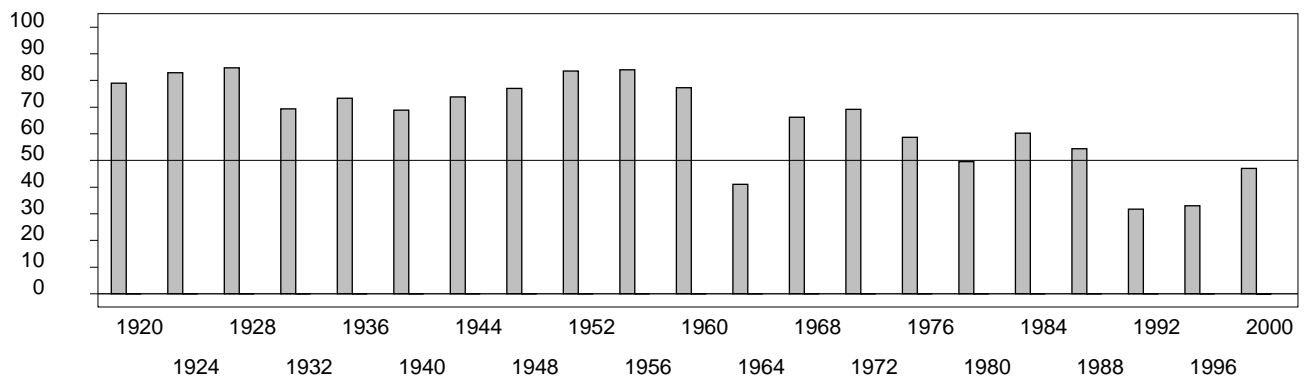
Figure 3. R-DEX: % by which County GOP% is above/below the State GOP%.